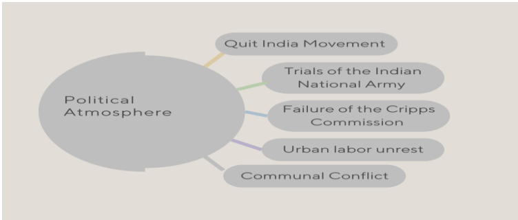
Figure 1: Political Unrest Indicators